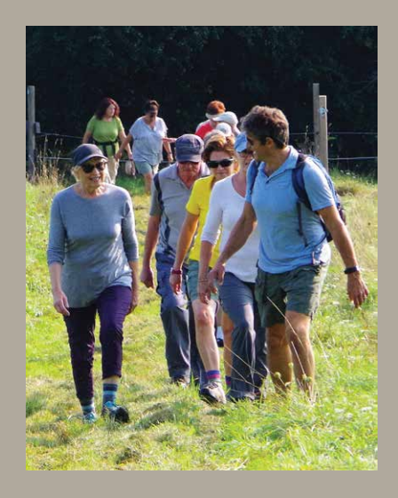
CATS is a mainstay of the Adirondack Harvest Festival, which attracts thousands of people to the area.

Champlain Area Trails has been an integral part of the Adirondack Harvest Festival since it began. The Festival draws thousands of people to the Champlain Valley each year and is an economic stimulus as much as it is a community celebration. The annual group hike that CATS offers during the Festival provides a unique opportunity for people to directly engage with Adirondack farmland and wildlands. The CATS hike is a fun part of the Festival for local community members and visitors alike.